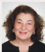
Prof. Gorun Arun , Turkey Use of Concrete in Historic Structures