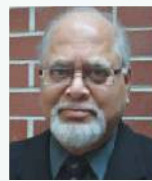
Prof. N K Srivastava , Canada Some Observations from the Structures in Nature-4: With Special Reference to Concrete Infrastructures